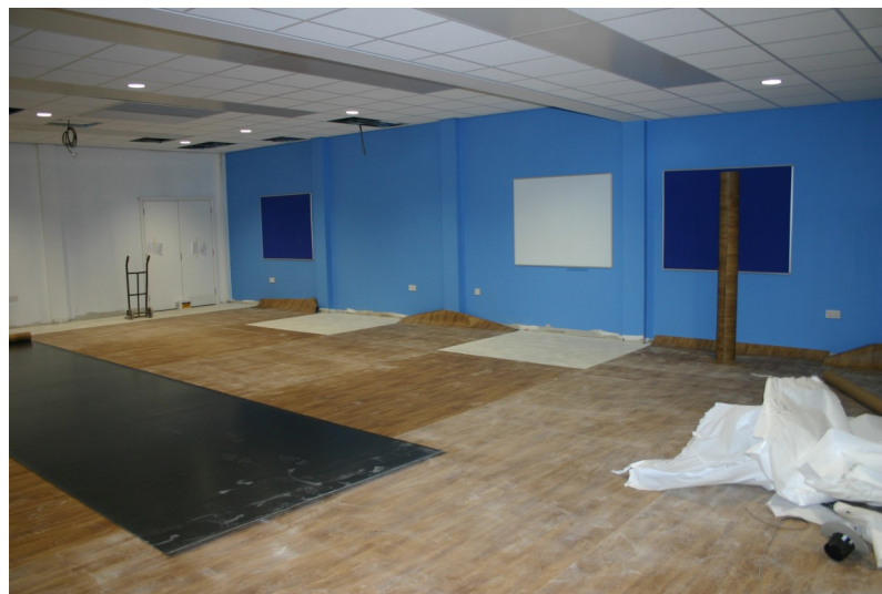
The dining room