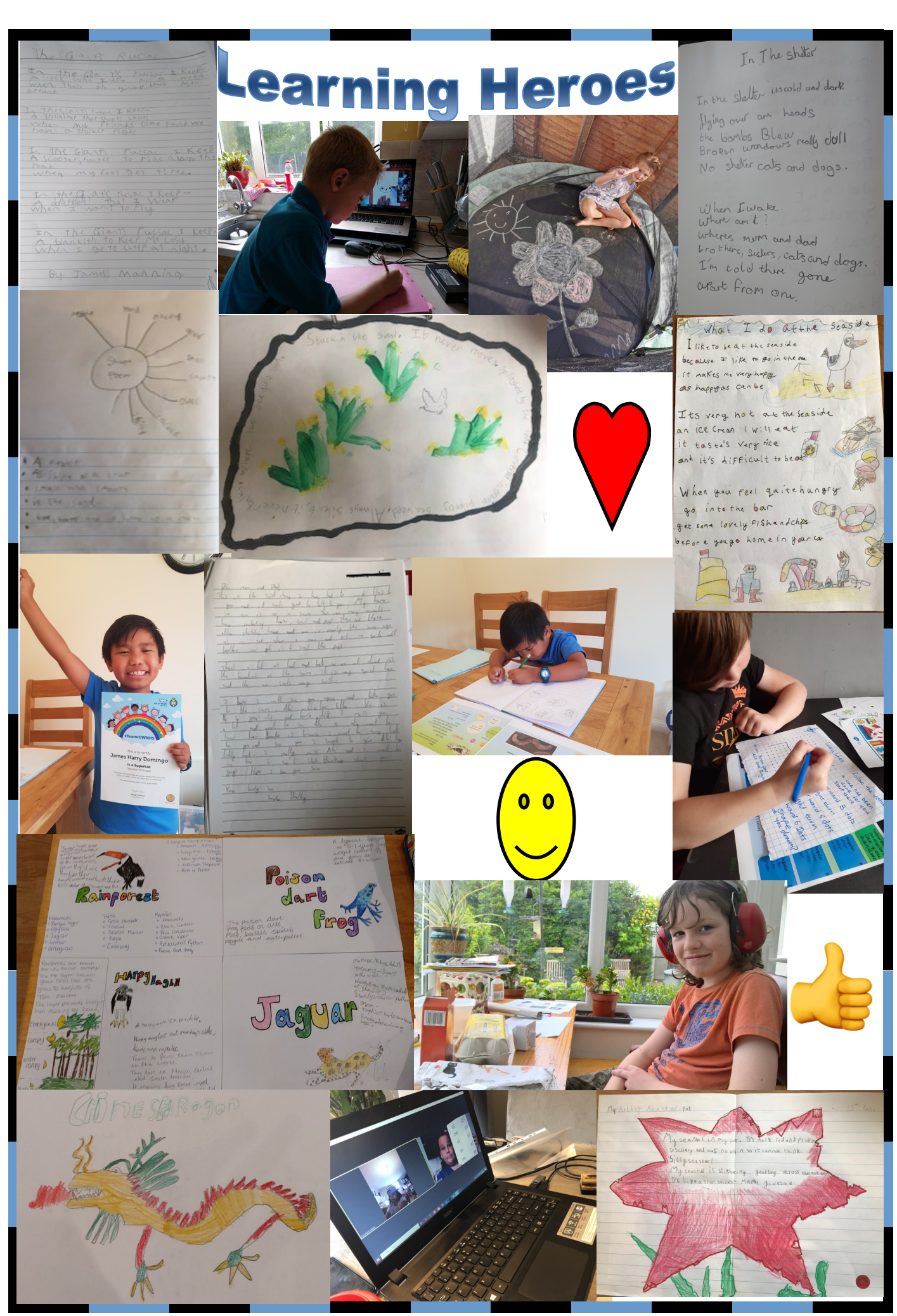
Working together for a successful future