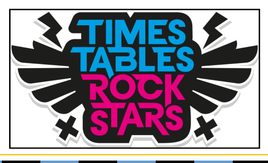
Working together for a successful future

https://www.queensgateprimary.co.uk/parents/times-tables-rockstars