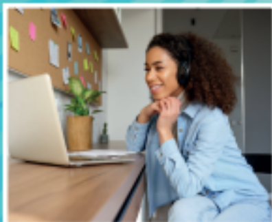
3102 08P 1/22/LC

For more information on Multiply courses being offered on the Island and to see if you qualify, please visit: www.iow.gov.uk/multiply